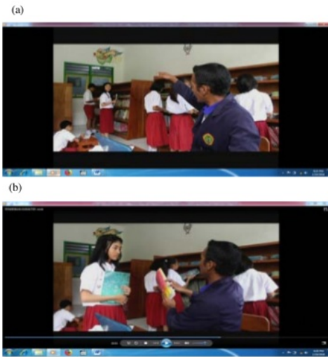
Fig. 7: a, b) Student's attitudes studied in the library diligently

getting achievement. Teacher's primary school played the character education movie. Second meeting, teacher's primary school explained the objective of the learning. It was finding out the creativity in seeking good behavior for primary school students. Teacher's primary school gave opportunity to the each students group to present some positive behavior for students and gave the command about actor behavior from the movie that had watched.