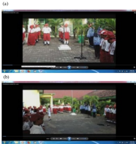
Fig. 3: a, b) Disciplined student's attitudes following the flag ceremony every monday