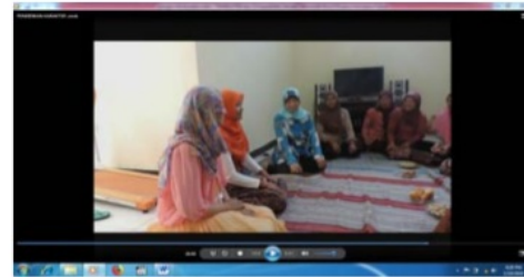
Fig. 8: Dialog between simple living parents

getting achievement. Teacher's primary school played the character education movie. Second meeting, teacher's primary school explained the objective of the learning. It was finding out the creativity in seeking good behavior for primary school students. Teacher's primary school gave opportunity to the each students group to present some positive behavior for students and gave the command about actor behavior from the movie that had watched.