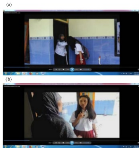
Fig. 2: a, b) The attitude of a decent child and respect for parents

guidance good behavior for the primary school students, next day the children go to school by good behavior to the parents, thrift, like saving a money, discipline, keep clean the school and show the other students that naughty, lazy, lavish, like buying snack do not care about cleanliness and the effect is when the examination day they cannot do the test. Another activities are there are association of the parents in the village, one of the parents that show the thrift not arrogant and there are