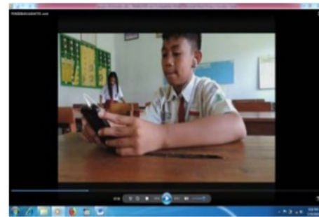
Fig. 6: a, b) Lazy child behavior

parents that has character that show off their wealth, arrogant and actually they have problems to another person.