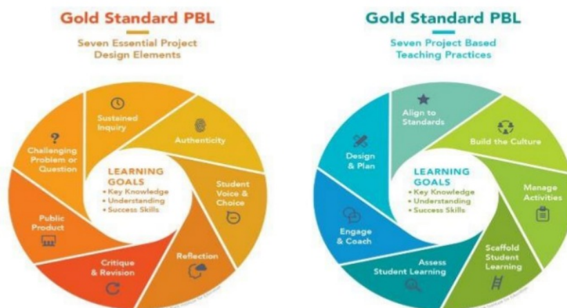
Fig. 3. Gold standart of PBL in term of design element and teaching practice (2019).

Obviously, the project learning must be set out from those 7 principles; 1) the projects should be challanging in term of its task or questions, 2) must be authentic, 3) elaborate and accomodate students voices and choices, 4) require critiques and revisions, 5) sustaides inquiry, 6) the product of the roject must presented in public, and also need reflection of the project impact ( www.pblworks.org ). This means that the main goal of project based leaning is incorporating students with a real life skill and empower students to both acknowlade cognitive skill as well as practical skill. To achieve those noble goals, an educater should also consider some keys which include designning and planning a beneficial and challanging projects ahich align the standarts. Furthermore, taecher should actively coach and engage students in every consultation sessions, later on, it will build students' strong determination and a good habit for students rigorously manage their self to be panctual, cooperate, and communicate).