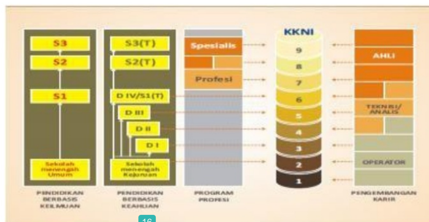
Fig. 1. Nine Qualifications Levels in IQF

Obviously, The issue of high order thinking skill (HOTS) has been current direction of the national curriculum not only in primary level but also in tertiary level. The Minister of Education and Culture of Indonesia has passed the policy dealing with specific working description stipulated in level 6 to level 8 in the Indonesian Qualification Framework (IQF) that emphasizes the essence of integrating technology in teaching and learning practices (Kementrian Pendidikan Nasional Republik Indonesia; 2011). Briefly, IQF is a national framework in equalizing as well as integrating three major elements of personal qualification (Indonesian citizen) in the fields of education, work training, and work experince (Figure. 1). Further, the IQS also highlights the necessity of the technology should be performed by Indonesian teachers possessing a Bachelor's or Master's degree and be implemented into teaching and learning activities in higher education contexts.