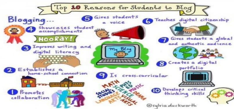
Fig. 2. students motive in making blog (Duckworth: 2015).

produce them and the way in which viewers engage with them. this eventually do not require teams of editors; authors control content and timing of publication (Griffith & Papacharisi : 2010). Recently, many people all over the world tend to document their special moments by recording them then uploaded in Youtube channel. This phenomena might born from different reasonsn and point of views, but from the statistical data the amount of Youtube Vlogger is significantly rising all the time (tribun jateng : 2019). Another research was conducted by Duckwort (2015) dealing with the reasons of students blogging as follows;